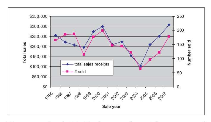
Figure 1. Graded bull sales—number sold per year and total sales receipts.