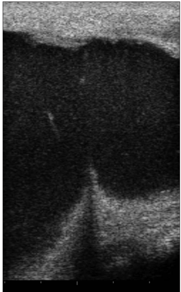
Figure 1—Ultrasonographic view of the caudal portion of the vagina and vestibule of an 8-year-old Quarter Horse–Paint mare examined because of colic and stranguria of 12 hours' duration. The ultrasonogram was obtained during transrectal ultrasonographic examination with a 7.5-MHz linear-array transducer c at a depth of 8 cm. Cranial is to the left side of the ultrasonogram, and caudal is to the right. Notice the vestibulovaginal fold and that the vagina and vestibule appear to be distended with hyperechoic fluid. The bladder is not visible. Tick marks at the bottom of the image are at intervals of 1 cm.